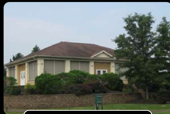
THE PAVILION AT MAINLAND