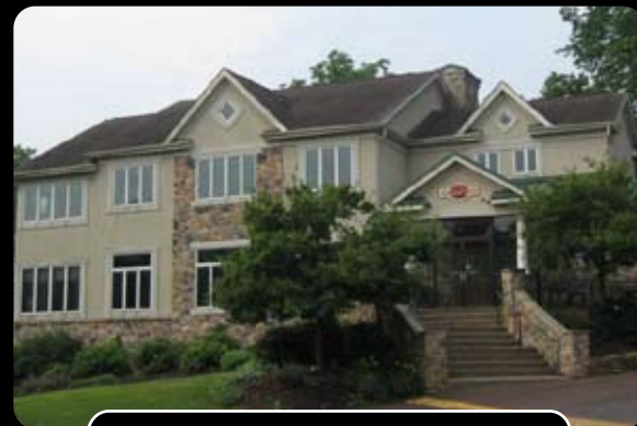
THE MAINLAND GRILLE